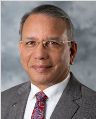
K.R. Ravindran Trustee Chair 2020-21